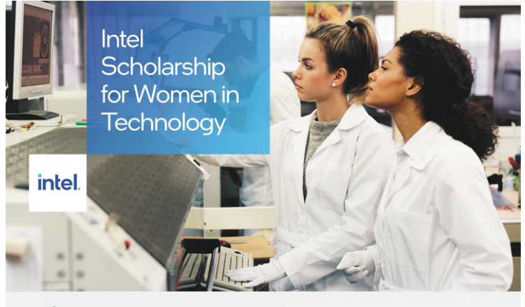
$5,000 Scholarships Available

<u>Click here</u> to learn more and apply.